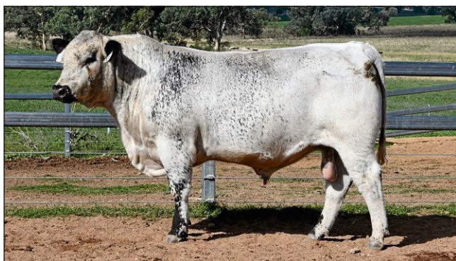
Top priced lot, JAD Sizzler S50, proved popular among bidders, eventually selling for $55,000.

out for us. He'll be going over heifers and will suit our program.